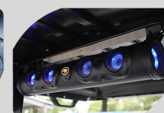
Cylindrical HDK Sound Bar