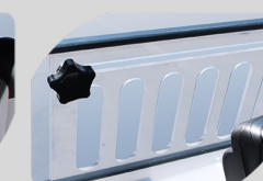
Slideable Air Vents