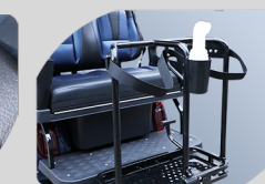
Golf Bag Holder