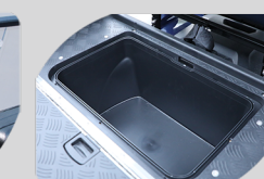
Rear Storage Compartment