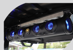
Cylindrical HDK Sound Bar