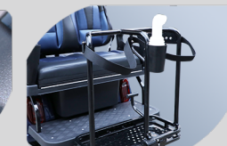
Golf Bag Holder