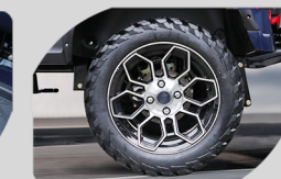
Silent Tire with Off-road Thread