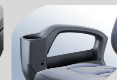
Rear Armrest With Built-in Storage Compartment